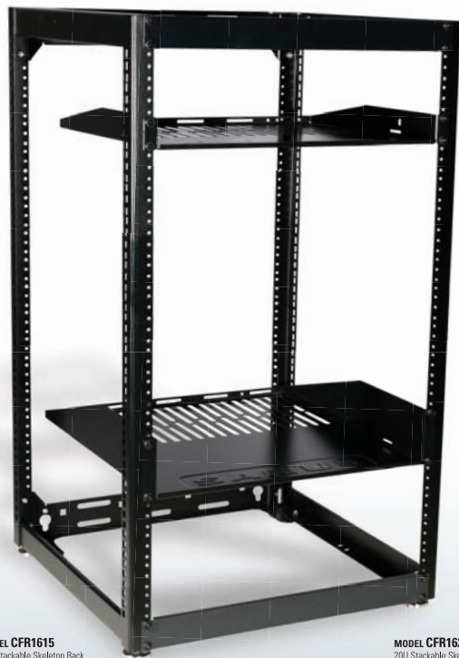
MODEL CFR1615 15U Stackable Skeleton Rack

Skeleton structures can be coupled into five height combinations: 40U, 35U, 30U, 20U and 15U